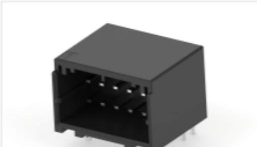
TE Part #CAT-D9934-A15F Header Assembly: Wire-to-Board, 5A, gold or tin plated