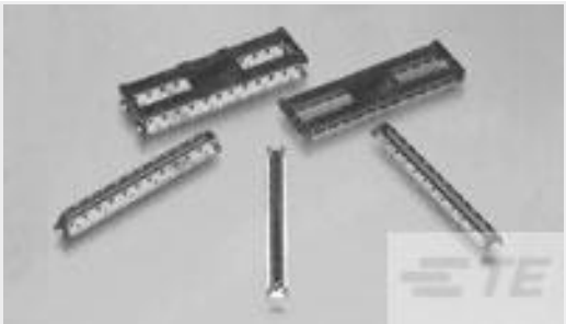
TE Part #3-1827231-6 .5FHR04H,440,B,GIG,08/Sn,HT,NS