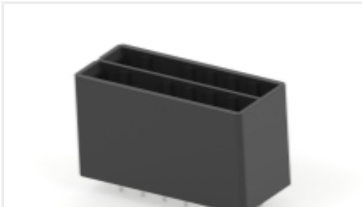
TE Part #CAT-D9934-A75F Header Assembly: Wire-to-Board, 15A, gold or tin plated