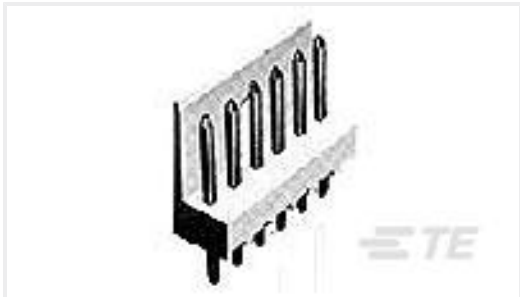
TE Part #171825-5 5 POS EIS POST HDR