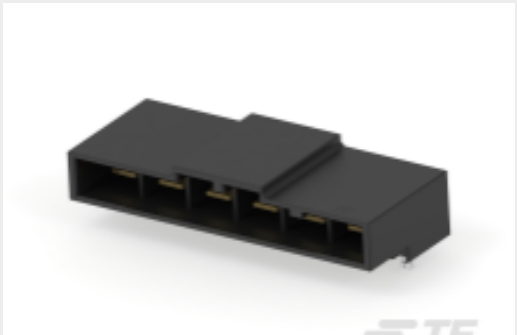
TE Part #6-2260661-1 DYNAMIC D5900 HORIZONTAL HDR ASSY 6P-X