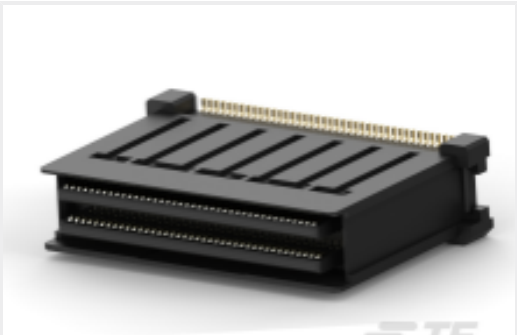
TE Part #2305220-1 MICRO STACK HDR ASSY 20MM 0.1 GOLD