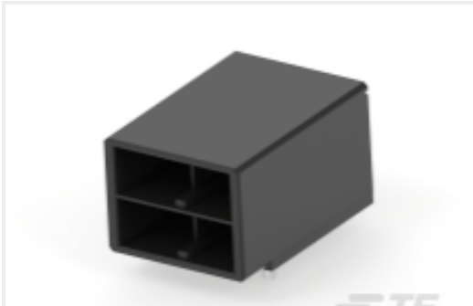
TE Part #CAT-D9934-A83B Header Assembly: Wire-to-Board, 20-45A, 250-630V