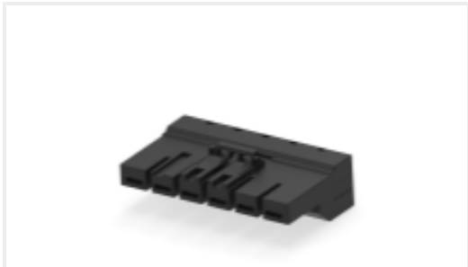
TE Part #6-2260663-1 DYNAMIC D5900 REC CONNECTOR ASSY 6P-X