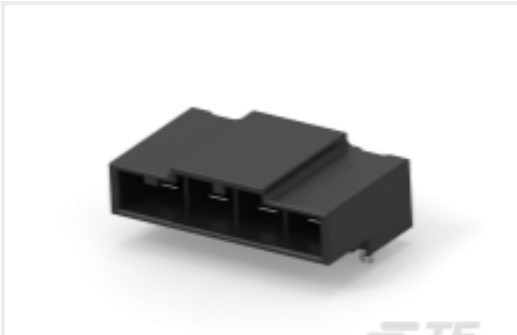
TE Part #4-2260661-2 DYNAMIC D5900 HORIZONTAL HDR ASSY 4P-Y