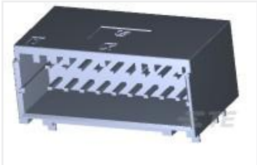
TE Part #1-1827876-0 DYNAMIC 1200D HDR ASSY H 20PX BLACK GOLD