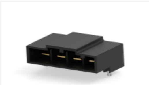
TE Part #4-2260661-1 DYNAMIC D5900 HORIZONTAL HDR ASSY 4P-X