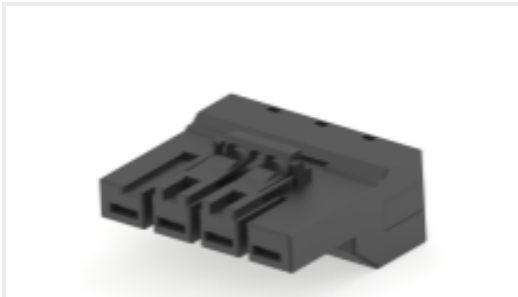
TE Part #4-2260663-1 DYNAMIC D5900 REC CONNECTOR ASSY 4P-X