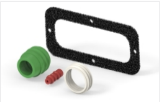
Connector Seals & Cavity Plugs(35)