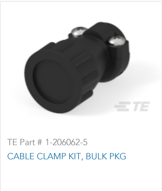
TE Part # 1-206062-5 CABLE CLAMP KIT, BULK PKG