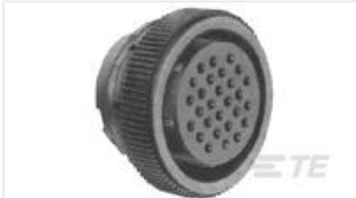
TE Part #205838-1 CPC PLUG ASSEMBLY SIZE 11-8