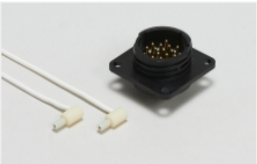
Circular Power Connectors(423)