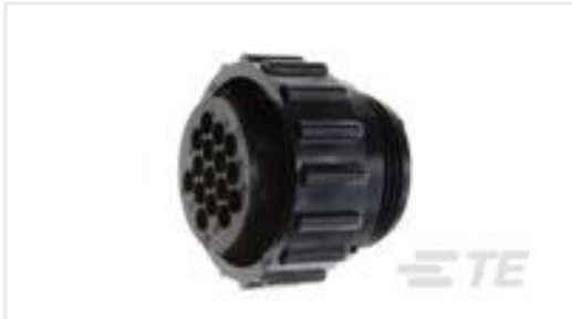
TE Part #206037-1 CPC PLUG ASSEMBLY SIZE 17-16