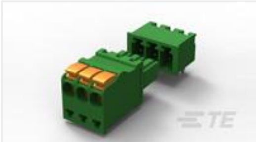
TE Part #1986692-9 STR PLUG SPRING TYPE RH 9P, 3.50 mm