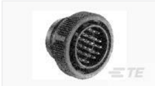
TE Part #206434-1 CPC PLUG ASSEMBLY SIZE 11-8