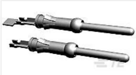
TE Part #1-66103-8 III+ PIN,24-20,TIN,LP