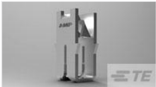
TE Part #62420-1 MAG-MATE TERM 20-22 016 TPBR