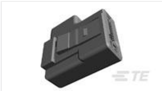
TE Part #4-292249-2 1.5 MINI CT LATTICE PLUG/KIT K