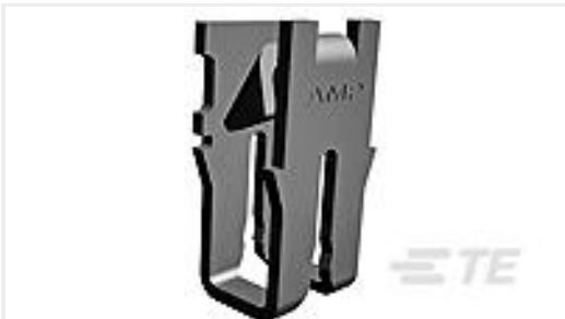
TE Part #62833-1 MAG-MATE POKE-IN TERM 016TPBR