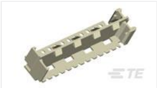
TE Part #175133-8 CT DBL ROW 8P HOLDER 8P NATURA