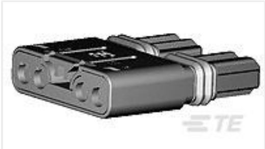
TE Part #2106135-4 Assembly, Free Hanging Plug, SLC, 4 pos