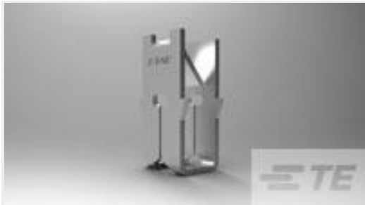
TE Part #62429-1 MAG-MATE TERM 27-30 013TPBR