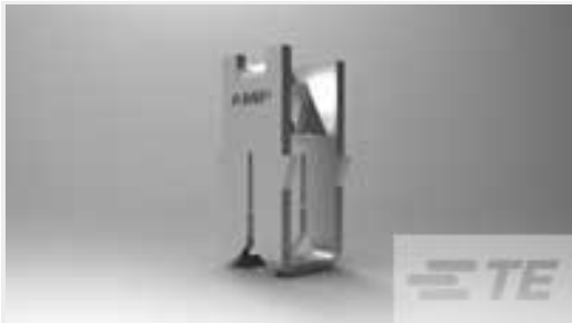
TE Part #62935-1 MAG-MATE TERM 27-23 016 TPBR