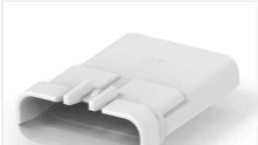
TE Part #2443725-7 CAP HOUSING FREE HANGING 7PIN