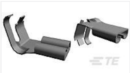
TE Part #170140-2 187 FASTON,FLAG,REC.,16-20 AWG, TPBR