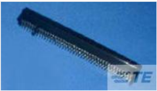
TE Part #8-1734774-1 PCI EXP 2.3L 64 POS BLK 15u"