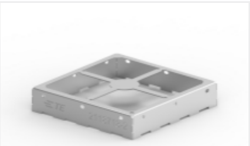
TE Part #2118718-2 STD SHIELD FRAME, CRS-26.21X26.21X5.08MM