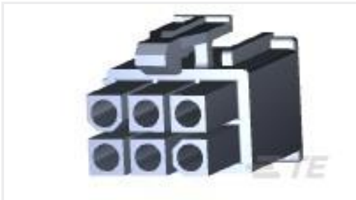
TE Part #172168-1 6 CIR UNIV M-N-L PLUG