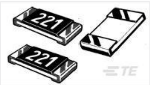
TE Part #1-2176070-5 3521 39R 1% 2W