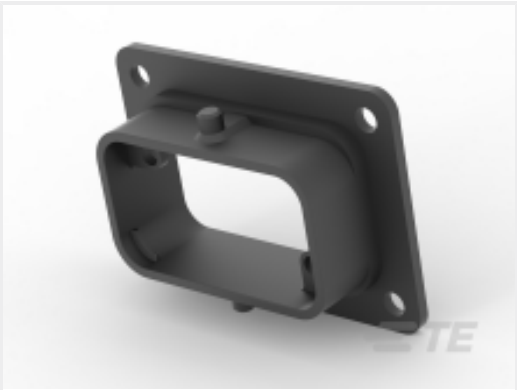
TE Part #2295892-1 SHROUD PLASTIC