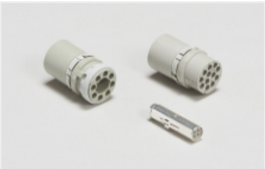
Circular Connector Contact Inserts(2)