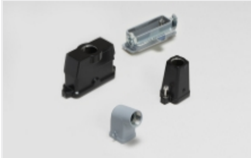
Rectangular Connector Hoods & Bases (4)