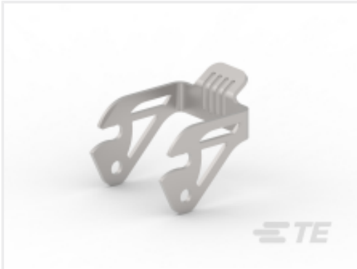
TE Part #2120339-1 SIDE CLIP