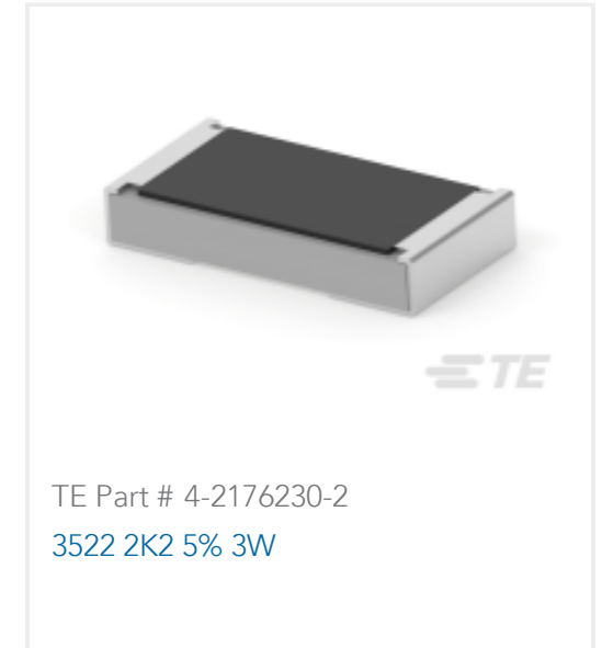
Also in the Series | CGS 3522