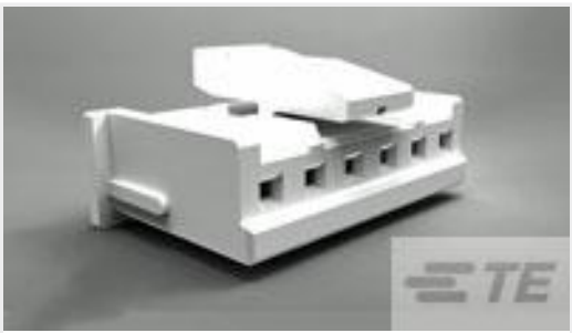
TE Part #1744417-3 3 POS EP 2.5 HSG, GLOW WIRE