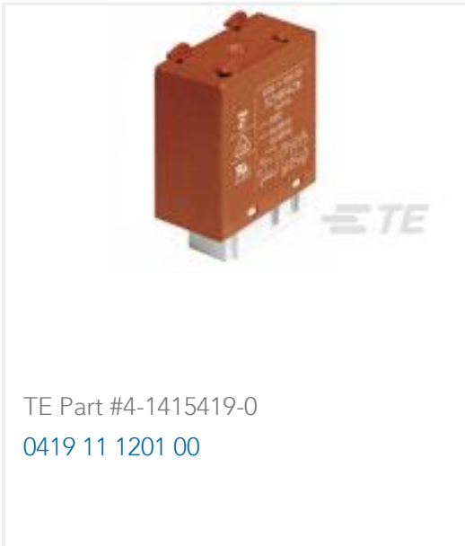
TE Part #4-1415419-0 0419 11 1201 00