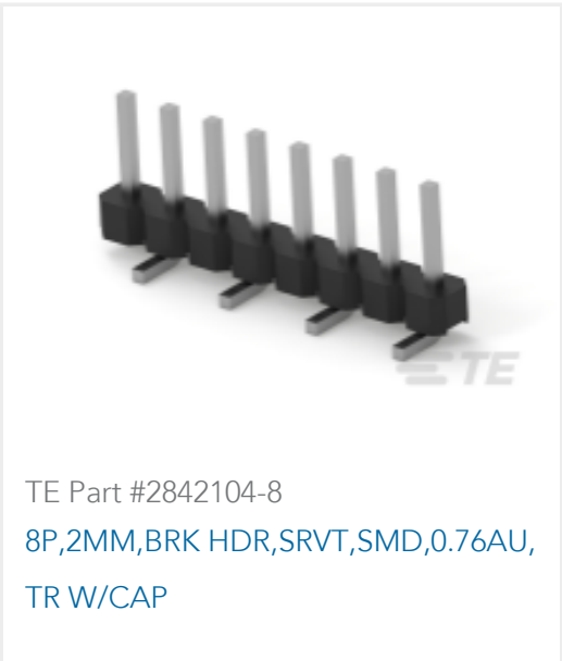
TE Part #2842104-8 8P,2MM,BRK HDR,SRVT,SMD,0.76AU, TR W/CAP