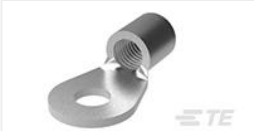
TE Part #130554 SOLIS 6 R M6