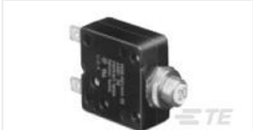
TE Part #4-1393249-0 W58-XC4C12A-10=W58