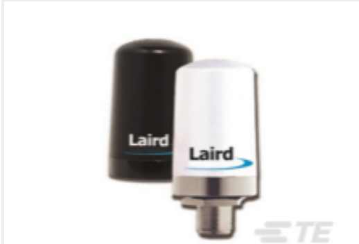
TE Part #TRAB24-49003P OMNI, Ph, 2400/4900MHz BK, 3 dBi, 60W,