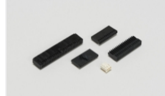
Wire-to-Board Connector Assemblies & Housings(3)