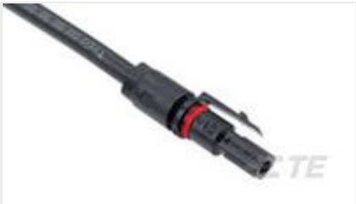
TE Part #1987559-1 PHOTOVOLTAIK CONNECTOR, 2.5 sqmm