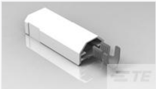
TE Part #521227-2 ULTRA-POD 250 ASSY TAB 12-10 AWG TPBR