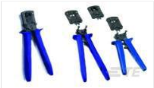
TE Part #1-1579004-2 CSV10 CRIMPING HANDTOOL SOLARLOK 4-6