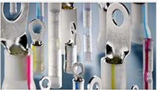
TE Part #53423-1 TERMINAL,PIDG PVF2 R 12-10 6