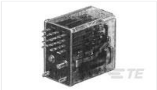
TE Part #1393766-3 R10-E1X2-S800=R10