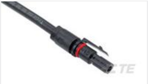
TE Part #1987559-1 PHOTOVOLTAIK CONNECTOR, 2.5 sqmm