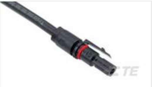
TE Part #1987559-1 PHOTOVOLTAIK CONNECTOR, 2.5 sqmm