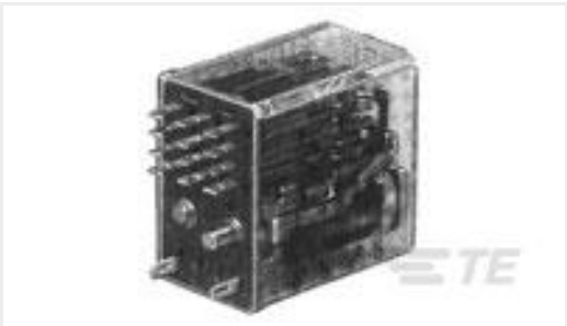
TE Part #1393766-3 R10-E1X2-S800=R10