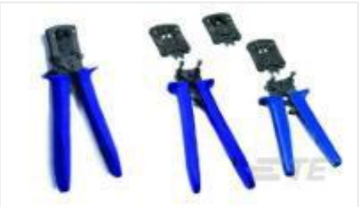
TE Part #1-1579004-2 CSV10 CRIMPING HANDTOOL SOLARLOK 4-6