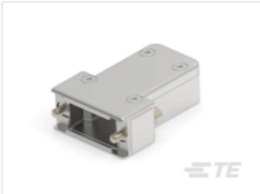
TE Part #1-2308340-1 FULL METAL HOODS SIZE 1