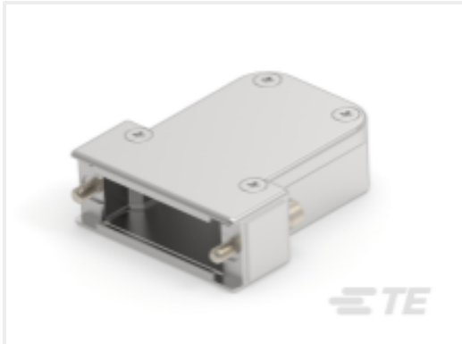
TE Part #1-2308341-1 FULL METAL HOODS SIZE 2