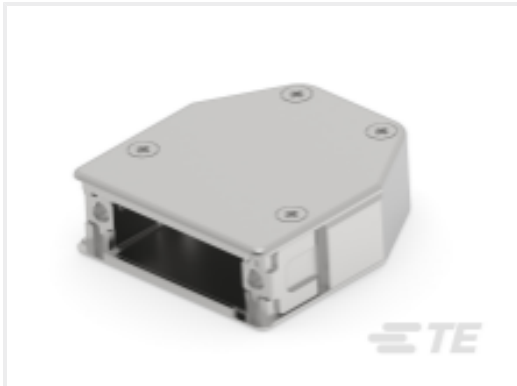
TE Part #1-2308321-1 FULL METAL HOODS SIZE 2, (1)