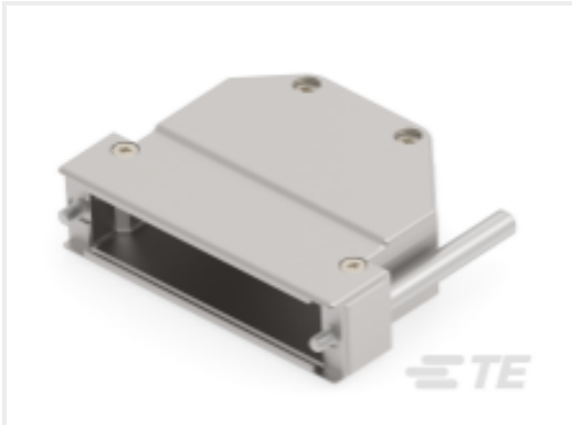
TE Part #1-2308345-5 FULL METAL HOODS SIZE 4 - 5 (RAW)