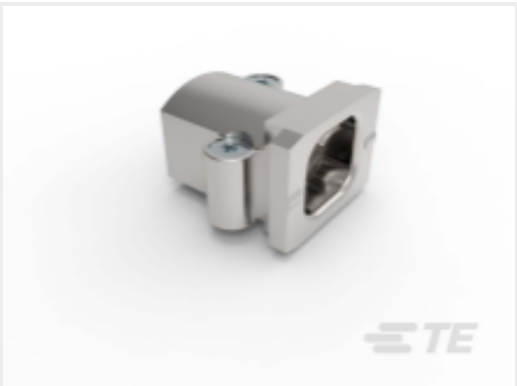
TE Part #CAT-R131-C1121A Cable Clamp for Size 4-5 STD/5QL Shell