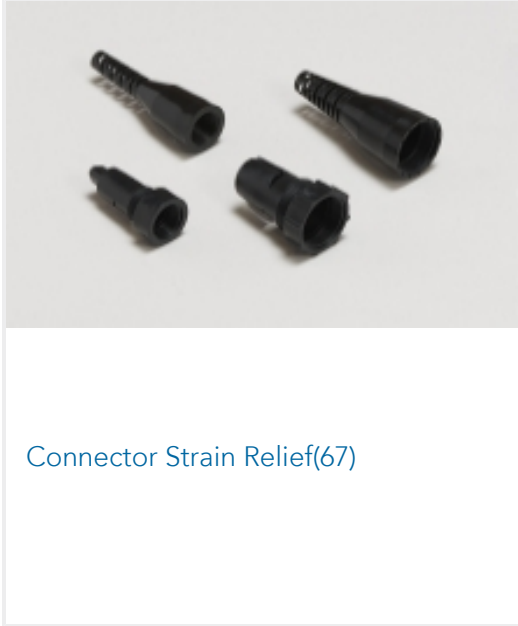
Connector Strain Relief(67)