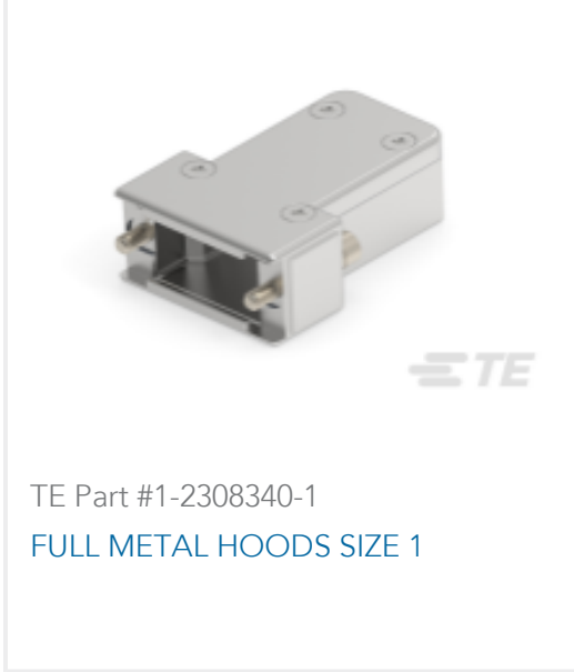
TE Part #1-2308340-1 FULL METAL HOODS SIZE 1