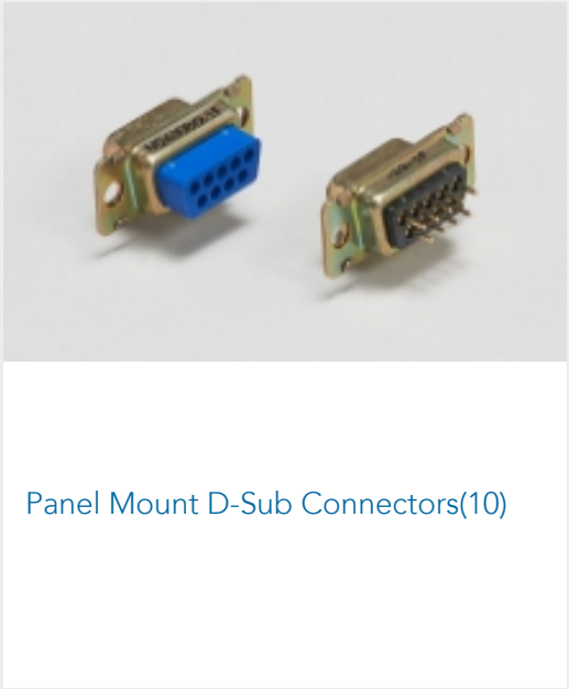
Panel Mount D-Sub Connectors(10)