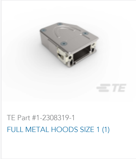
TE Part #1-2308319-1 FULL METAL HOODS SIZE 1 (1)