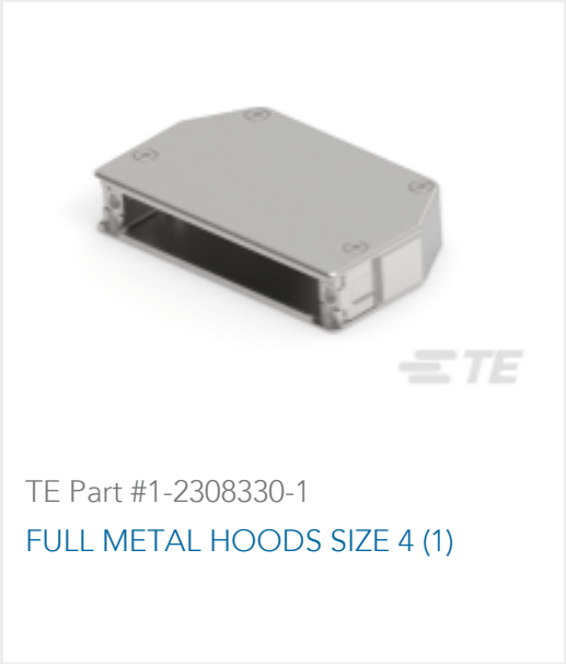
TE Part #1-2308330-1 FULL METAL HOODS SIZE 4 (1)