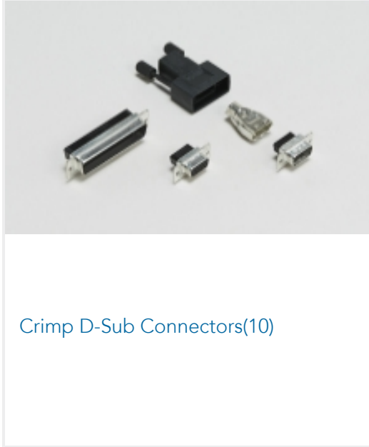
Crimp D-Sub Connectors(10)