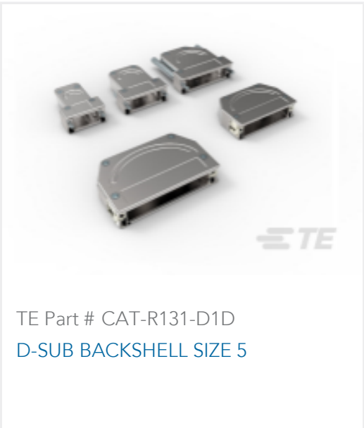
TE Part # CAT-R131-D1D D-SUB BACKSHELL SIZE 5