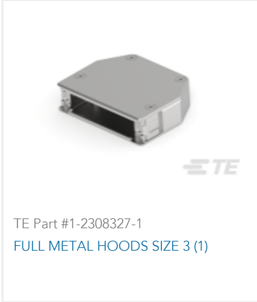
TE Part #1-2308327-1 FULL METAL HOODS SIZE 3 (1)