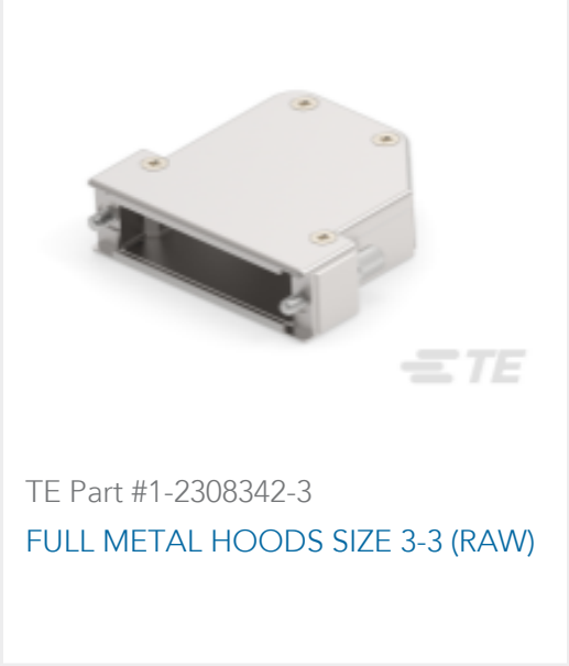
TE Part #1-2308342-3 FULL METAL HOODS SIZE 3-3 (RAW)