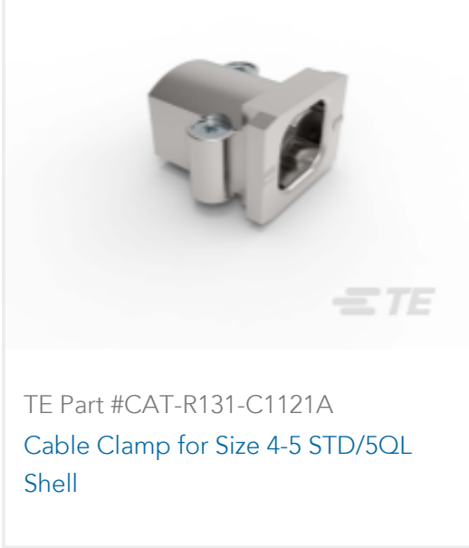
TE Part #CAT-R131-C1121A Cable Clamp for Size 4-5 STD/5QL Shell