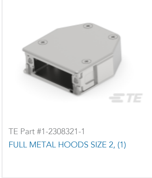
TE Part #1-2308321-1 FULL METAL HOODS SIZE 2, (1)