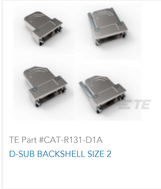
TE Part #CAT-R131-D1A D-SUB BACKSHELL SIZE 2