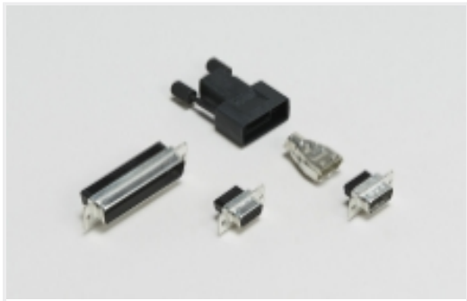
Crimp D-Sub Connectors(10)