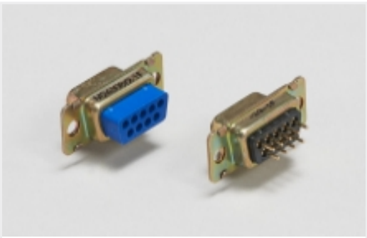
Panel Mount D-Sub Connectors(10)