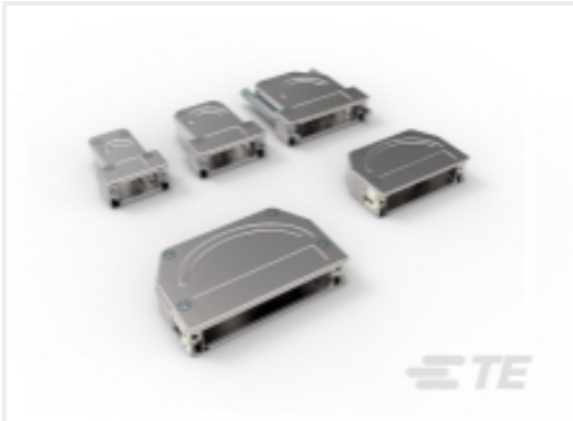
TE Part #CAT-R131-D1D D-SUB BACKSHELL SIZE 5