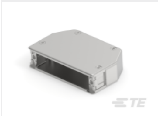
TE Part #1-2308338-1 QL-FULL METAL HOODS SIZE 5 (1 CABLE CLP)