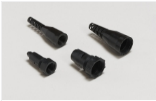
Connector Strain Relief(67)