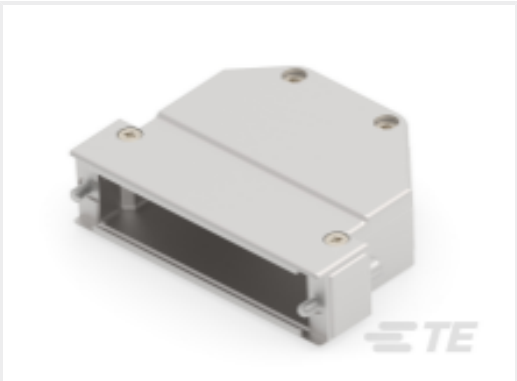
TE Part #1-2308345-1 FULL METAL HOODS SIZE 4