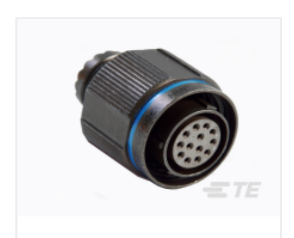
TE Part #YDTS26Z11-05SNV001 PLUG ASSY