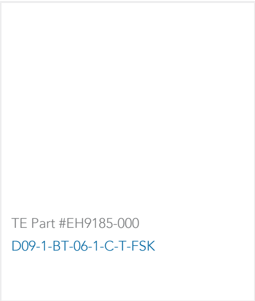
TE Part #EH9185-000 D09-1-BT-06-1-C-T-FSK