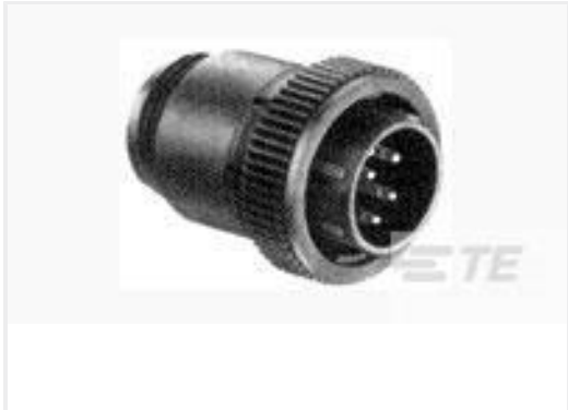
TE Part #211768-1 CPC PLUG ASSEMBLY SIZE 17-9