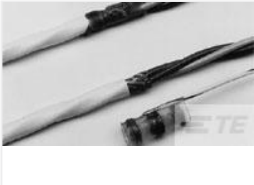
TE Part #152435-000 CWT-5-W122-5