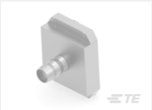
TE Part #1-2308348-2 CRIMP FLANGE 2 LARGE