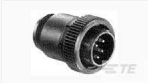
TE Part #211768-1 CPC PLUG ASSEMBLY SIZE 17-9