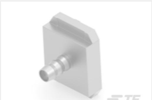
TE Part #1-2308348-1 CRIMP FLANGES LARGE