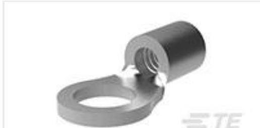
TE Part #31122 BODY,RING TONGUE 12-10 1/4