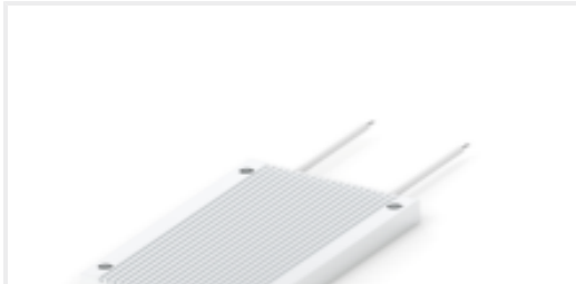
TE Part #1-2176250-7 TJT 500W 470R 5%