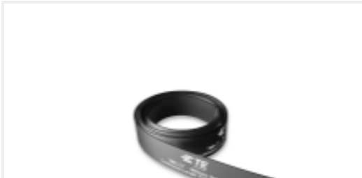
TE Part #ER2155-000 TMS-CT-50M-1-OUT-0