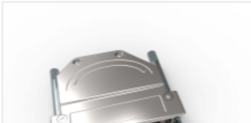
TE Part #1-2308346-5 FULL METAL HOODS SIZE 5 - 5 (RAW)