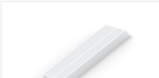
TE Part #1-2176510-7 CJP 500W 33R 5% Lead