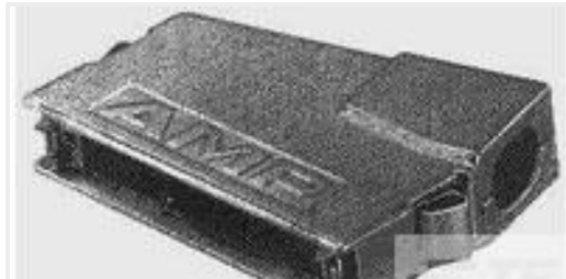
TE Part #5749202-2 50 50SR KIT,75D,UK