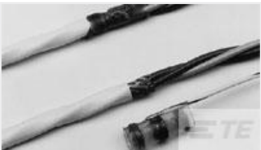
TE Part #945271-000 SO63-2-9030