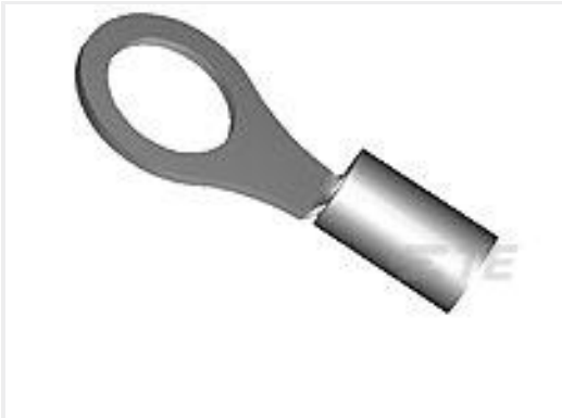
TE Part #31112 BUDGET RING 12-10 6