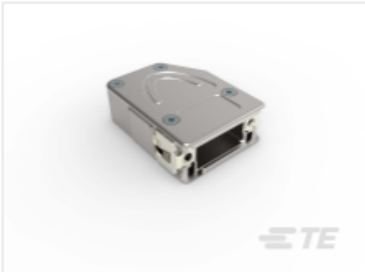
TE Part #1-2308319-1 FULL METAL HOODS SIZE 1 (1)