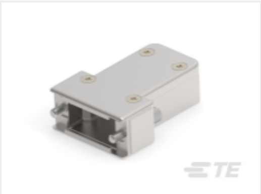
TE Part #1-2308340-2 FULL METAL HOODS SIZE 1- 2 (RAW 180 DEG)