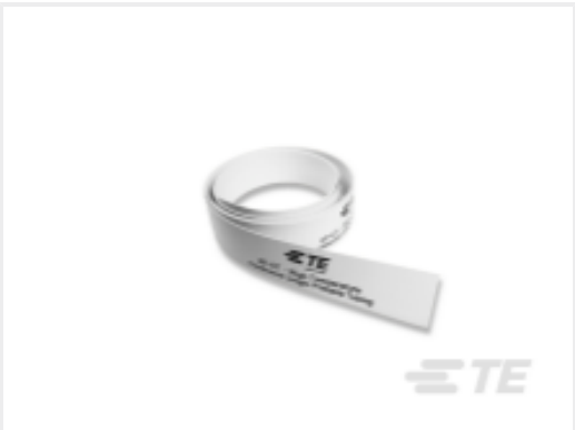
TE Part #CAT-C7679-H85999 Continuous Tube High Temperature HT-CT