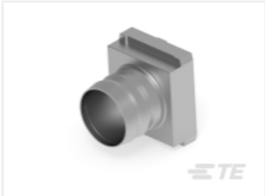
TE Part #1-2308349-2 CRIMP FLANGE 2 SMALL