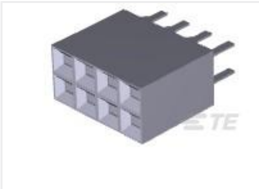
TE Part #5-534998-4 08 MODIV VRT DR CE 100/125