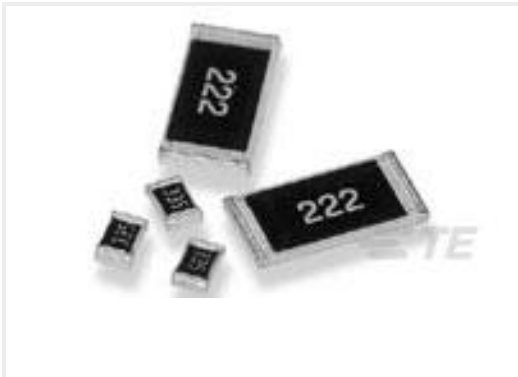
TE Part #4-1879377-4 CRGH0805 5% 56R 0.33W