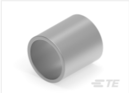
TE Part #1-2308350-2 CRIMP BARREL2