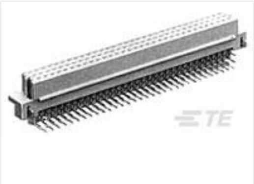
TE Part #5650461-5 ASSY,RECEPTACLE,EUROCARD,TYPE