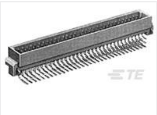
TE Part #650478-5 048 EURO TYPE C PIN ST ASSY