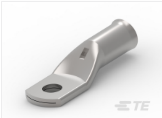
TE Part #710030-1 XCT 16-5