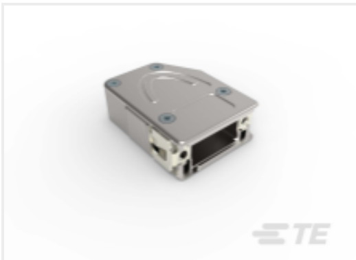
TE Part #1-2308319-1 FULL METAL HOODS SIZE 1 (1)