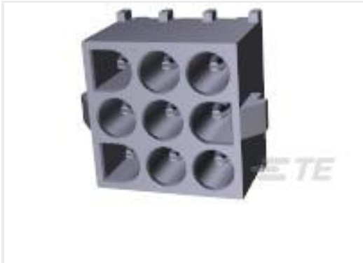
TE Part #350742-1 09P UMNL PIN HDR ASSY 94VO