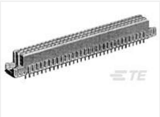
TE Part #535090-4 096 EURO TYPE C RECEPT ST ASSY