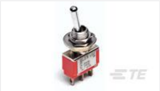
TE Part #4-1825136-9 A101SYZQ04