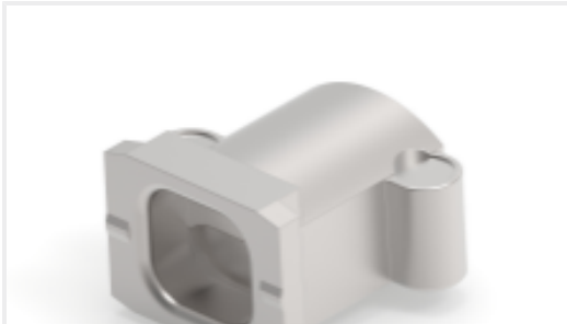
TE Part #1-2308272-5 CABLE CLAMP5 (CASE RAW)