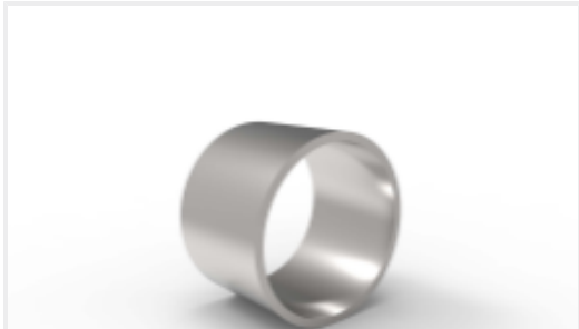
TE Part #CAT-R131-B2745 Crimp Barrel for D-Sub Connectors