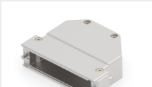
TE Part #1-2308346-1 FULL METAL HOODS SIZE 5