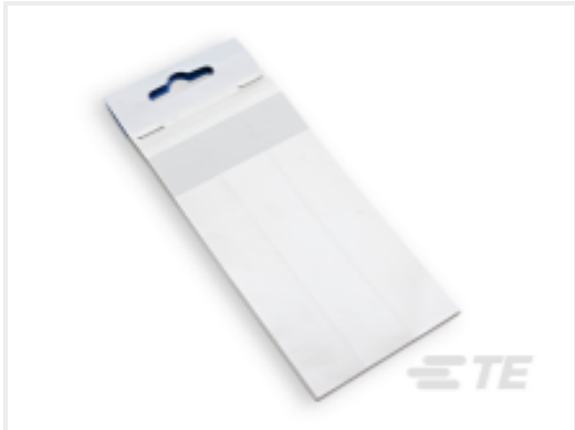
TE Part #8-1768048-1 TKM75-N