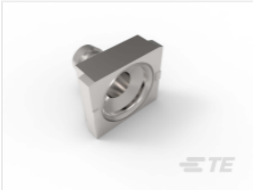
TE Part #CAT-R131-F614 Crimp Flange for Size 1-3STD/1-4QL Shell