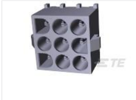
TE Part #350742-1 09P UMNL PIN HDR ASSY 94VO