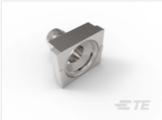
TE Part #CAT-R131-F614 Crimp Flange for Size 1-3STD/1-4QL Shell