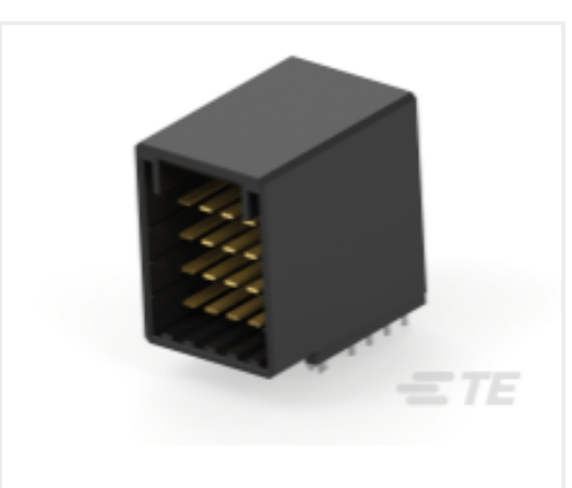
TE Part #CAT-D9934-A75H Header Assembly: Wire-to-Board, 15A, gold or tin plated