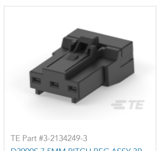
D3900S 7.5MM PITCH REC ASSY 3P BLACK Z