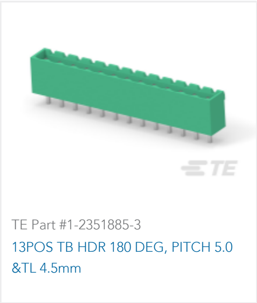
TE Part #1-2351885-3 13POS TB HDR 180 DEG, PITCH 5.0 &TL 4.5mm