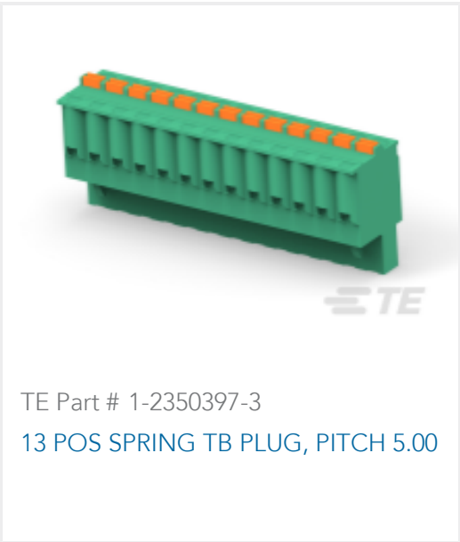
TE Part # 1-2350397-3 13 POS SPRING TB PLUG, PITCH 5.00