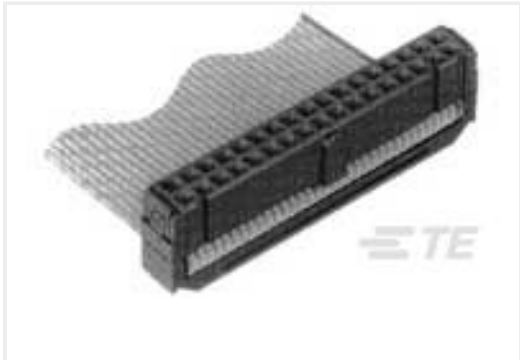
TE Part #1658622-2 14 NOVO MIL/CTR 30DP, LEAD FREE