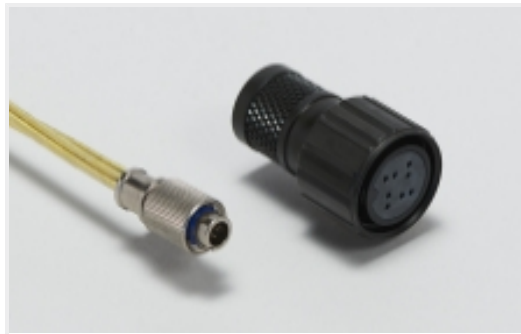
Standard Circular Connectors(793)