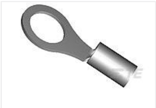
TE Part #342183-1 12-10 F.E.P.G. RING TONGUE 3BA