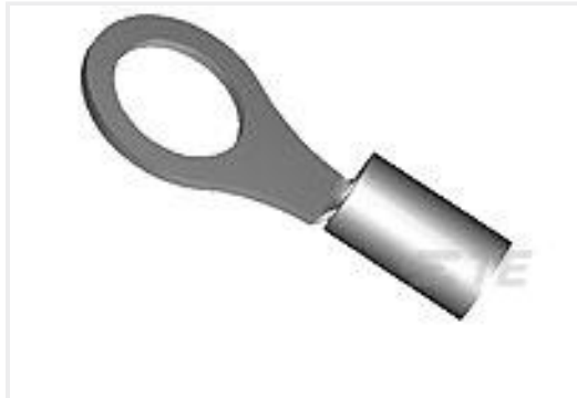
TE Part #2-342143-1 TAPE MOUNTED 16-14 F.E. TERMIN