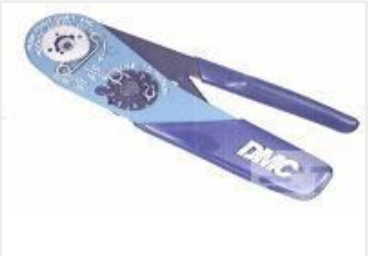
TE Part # 601966-1 CRIMPING TOOL M22520/2-01