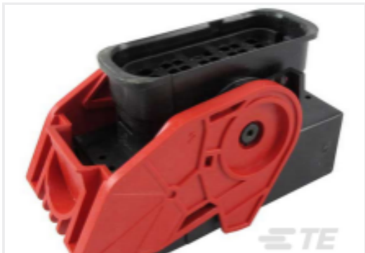
TE Part #SRK06-MDA-32A-001 PLG, 32P, BLK, E, A