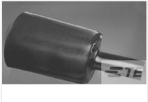
TE Part #CX7205-000 RHW-48/12-1200/ADH-0