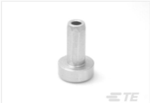
TE Part # 1-2823561-1 UNIVERSAL INSERT (ALL M12 CODES)