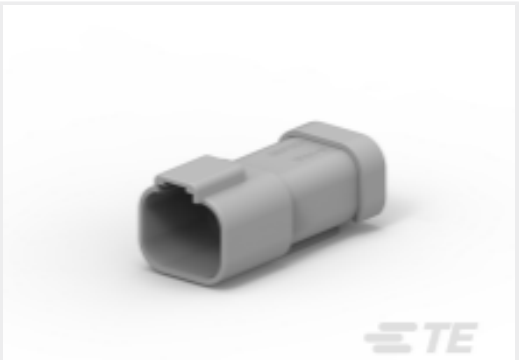
TE Part #DT04-4P-C017 REC, 4P, GRY, BLOCKED