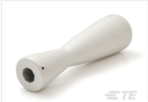
TE Part # 1-2823560-1 ASSEMBLY TOOL HANDLE FOR CRIMP FLANGE