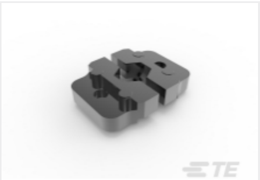
TE Part # CAT-R131-IN722 Crimp Insert for Use with 1-2823557-1