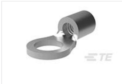
TE Part #2-34110-3 SOLIS R 22-16 COMM 22-18 MIL 6