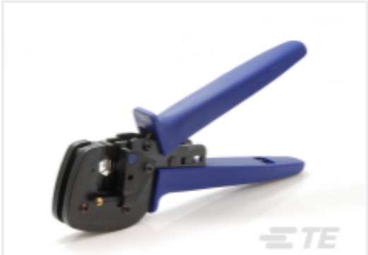
TE Part # 1-2823557-1 CRIMP TOOL FOR CRIMP FLANGE /SLEEVE