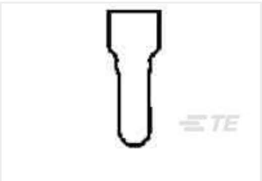
TE Part #8-35115-1 SPLICE, N CE 22-14