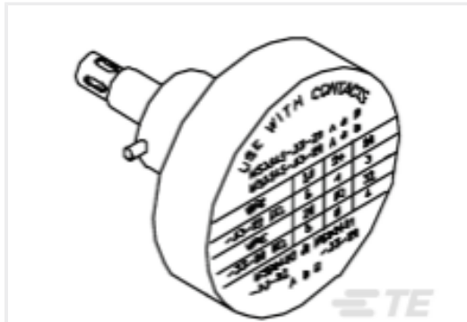
TE Part # CAT-M1-M1 M12 Assembly Tooling