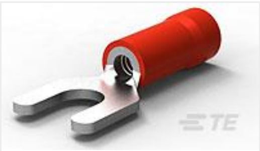
TE Part #320665 PG SPD 22-16 COMM 22-18 MIL 6