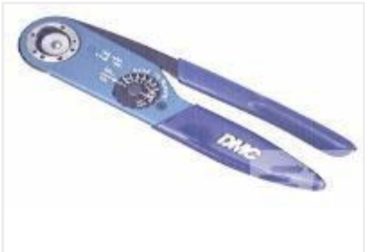
TE Part # 601967-1 CRIMPING TOOL M22520/1-01