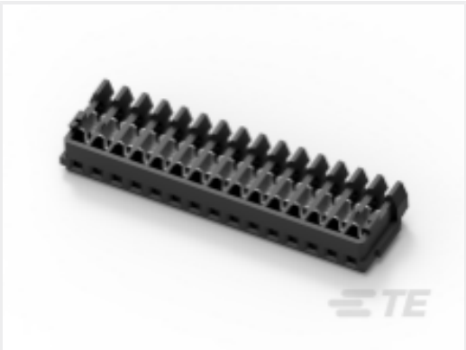
TE Part #3-353293-5 1.5MM CT MT REC ASSY 15P BLACK