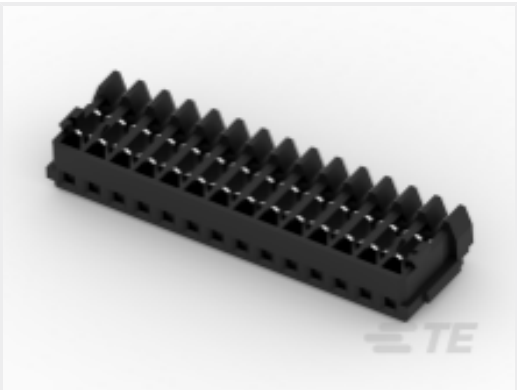
TE Part #3-353293-4 1.5MM CT MT REC ASSY 14P BLACK