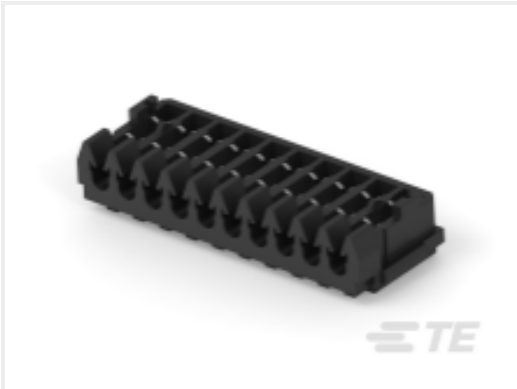
TE Part #3-353293-0 1.5MM CT MT REC ASSY 10P BLACK