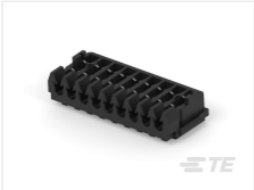
TE Part #2-353293-9 1.5MM CT MT REC ASS'Y 9P BLACK