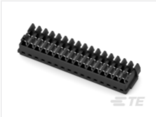
TE Part #3-353293-6 1.5MM CT MT REC ASSY 16P BLACK