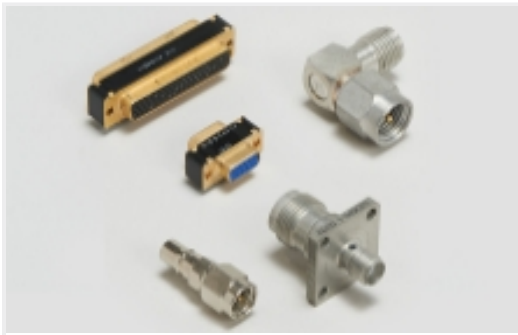
Connector Adapters & Connector Savers(8)