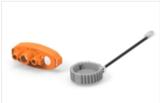
Connector Caps & Covers(3)