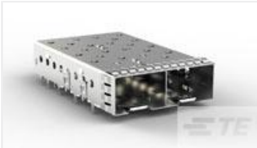
TE Part #2007263-1 SFP+ 1x2 Cage Assembly