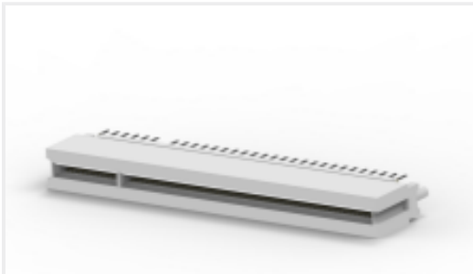
TE Part # 5145154-1 CONNECTOR, 60 DUAL POSITION, .