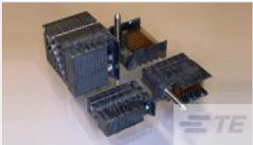
TE Part #2057417-1 IMP100S,R,RA4P8C,UG,39