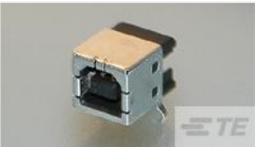
TE Part #292304-1 STD USB TYPE B, R/A, T/H