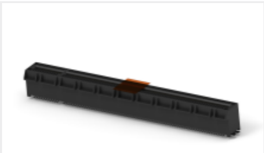
TE Part # 5-2337939-4 PCIE GEN4 CON,SMT,164POS,30u", MYLAR,HT