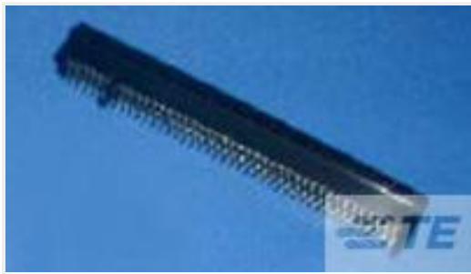
TE Part # 1734774-1 PCI EXP 3.1L 36 POS WHT G/F

This information is provided based on reasonable inquiry of our suppliers and represents our current actual knowledge based on the information they provided. This information is subject to change. The part numbers that TE has identified as EU RoHS compliant have a maximum concentration of 0.1% by weight in homogenous materials for lead, hexavalent chromium, mercury, PBB, PBDE, DBP, BBP, DEHP, DIBP, and 0.01% for cadmium, or qualify for an exemption to these limits as defined in the Annexes of Directive 2011/65/EU (RoHS2). Finished electrical and electronic equipment products will be CE marked as required by Directive 2011/65/EU. Components may not be CE marked. Additionally, the part numbers that TE has identified as EU ELV compliant have a maximum concentration of 0.1% by weight in homogenous materials for lead, hexavalent chromium, and mercury, and 0.01% for cadmium, or qualify for an exemption to these limits as defined in the Annexes of Directive 2000/53/EC (ELV). Regarding the REACH Regulation, the information TE provides on SVHC in articles for this part number is based on the latest European Chemicals Agency (ECHA) ‘Guidance on requirements for substances in articles’ posted at this URL: https://echa.europa.eu/guidance-documents/guidance-on-reach