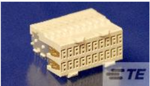
TE Part #6469028-1 HM-ZD 2PR RECP 40P