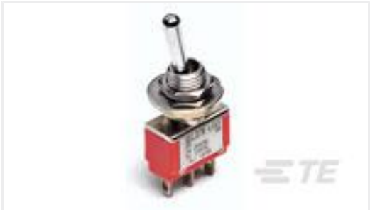
TE Part #1-1825139-8 A205SYZQ04