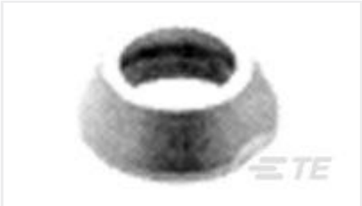
TE Part #1825621-1 N304=Mounting Nut Decorative