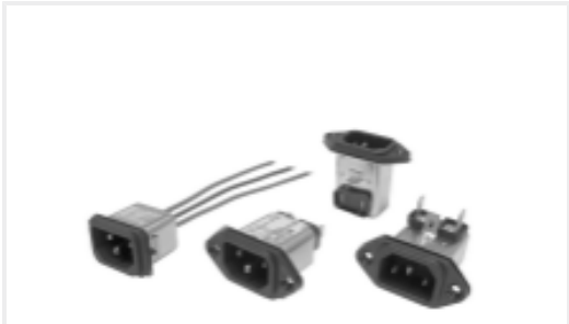
TE Part #CAT-C8114-SR15 IEC Filtered Inlets, Corcom SRB Series