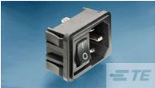
TE Part #1-1609112-3 15CBS1=F8273