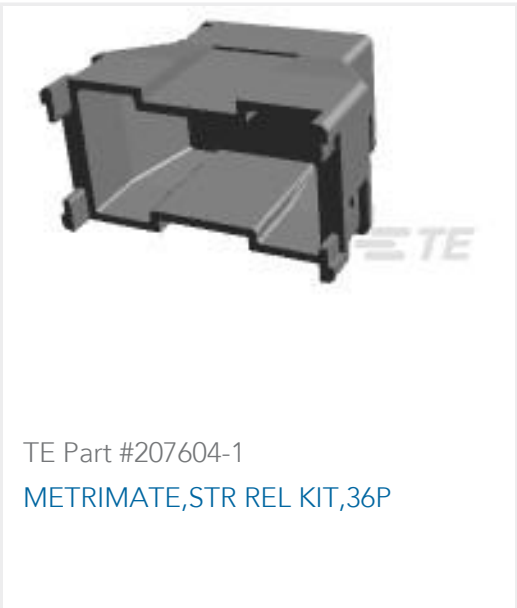
TE Part #207604-1 METRIMATE,STR REL KIT,36P