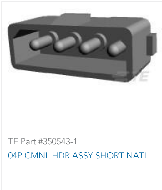
TE Part #350543-1 04P CMNL HDR ASSY SHORT NATL