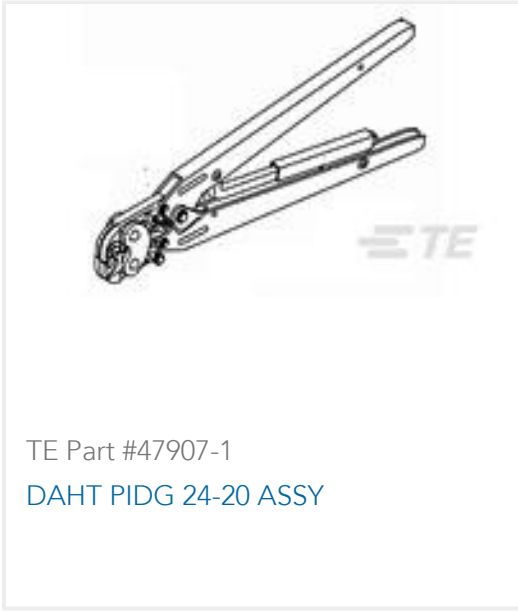
TE Part #47907-1 DAHT PIDG 24-20 ASSY