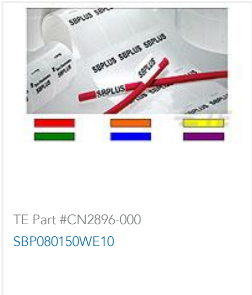
TE Part #CN2896-000 SBP080150WE10