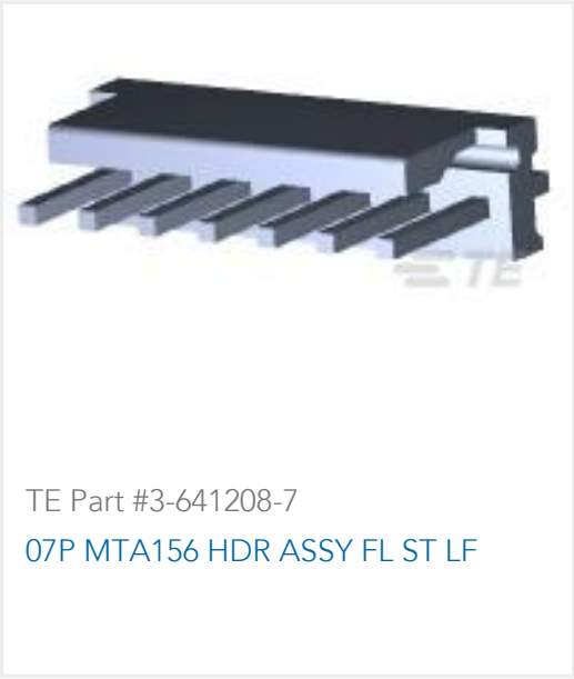
TE Part #3-641208-7 07P MTA156 HDR ASSY FL ST LF