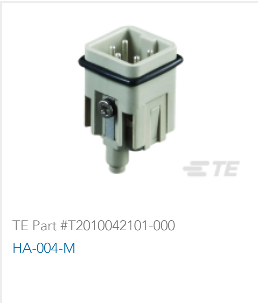
TE Part #T2010042101-000 HA-004-M