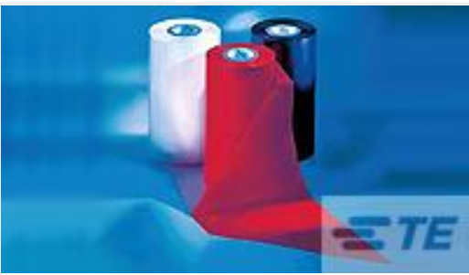
TE Part #754073-000 TMS-RJS-RIBBON-4HT