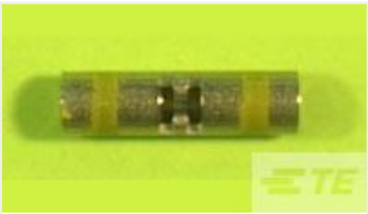
TE Part #680334-000 D-609-14