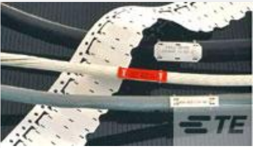
TE Part #3576550001 HTCM-SCE-1/4-4H-9