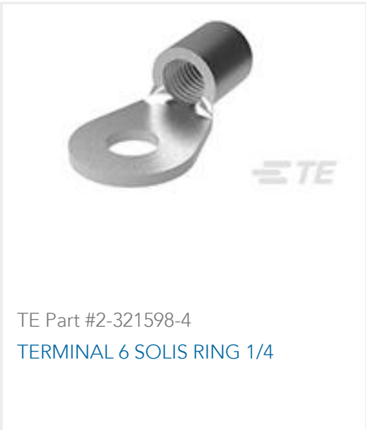
TE Part #2-321598-4 TERMINAL 6 SOLIS RING 1/4