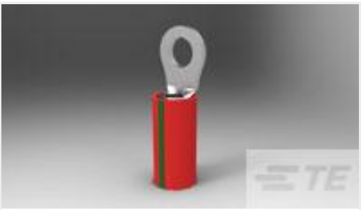
TE Part #2-36153-3 TERMINAL,PIDG R IR 22 10