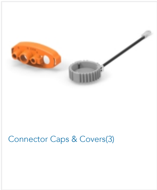
Connector Caps & Covers(3)