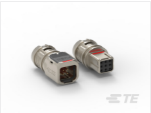
TE Part #YD369-MP99-NS10000 369 9 WAY SHIELDED PLUG, CRIMP, SKT