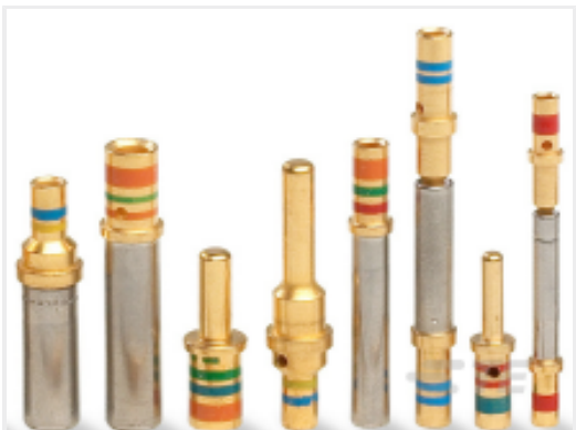
TE Part #12343-16-20 CONT SOC ASSY