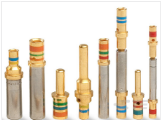
TE Part #106044-31 CONT SOC ASSY

will be CE marked as required by Directive 2011/65/EU. Components may not be CE marked. Additionally, the part numbers that TE has identified as EU ELV compliant have a maximum concentration of 0.1% by weight in homogenous materials for lead, hexavalent chromium, and mercury, and 0.01% for cadmium, or qualify for an exemption to these limits as defined in the Annexes of Directive 2000/53/EC (ELV). Regarding the REACH Regulation, the information TE provides on SVHC in articles for this part number is based on the latest European Chemicals Agency (ECHA) 'Guidance on requirements for substances in articles' posted at this URL: https://echa.europa.eu/guidance-documents/guidance-on-reach