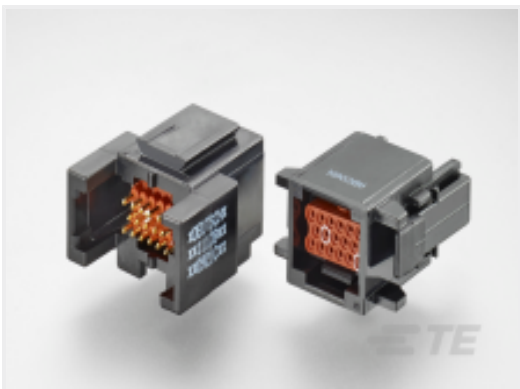
TE Part #ABC06Y-20S-4048 IN-LINE PLUG