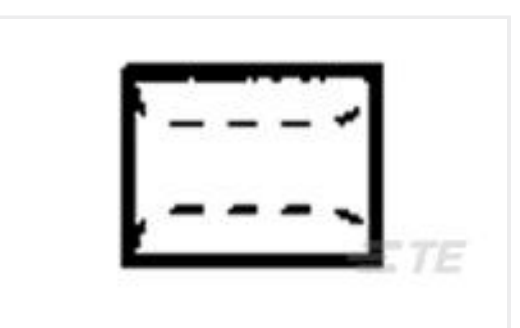
TE Part #323030 SPLICE,SOLIS PARA HR 22-16