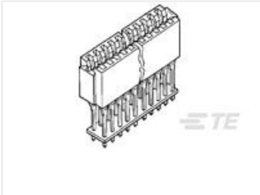
TE Part #1-5147490-0 Next Gen PACE Conn 10 POS 1X2