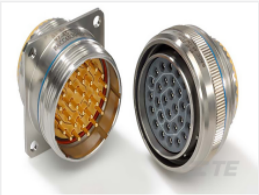
TE Part #ZPF000000000008043 983-3KE-C 14