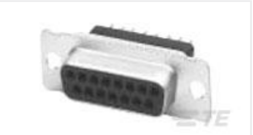
TE Part #205736-4 15 RCPT SP/MS STD