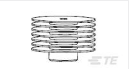
TE Part #7-1542006-8 HTS804-U=29MM HS ASSY ULTEM CL