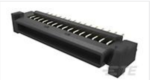
TE Part #5176374-2 AMP FH CONN REC V 60P (H=14)