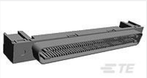
TE Part #5787885-1 200 CMP DCK RA PLG INV SHL 3.4