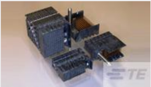
TE Part #2149977-2 IMP100S,H,V4P6C,UG,REW39,4.9