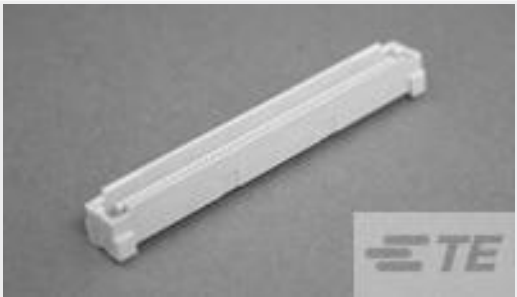
TE Part #1-5084615-0 0.8FH,P06H.5,200,30/Sn,TU