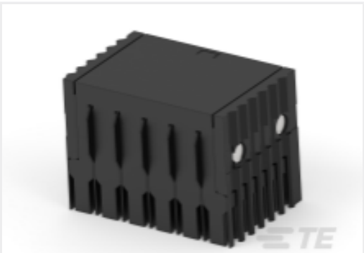
TE Part #2018849-1 ASSY, SEATING TL, 6 ROW, 6 COL