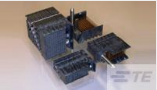
TE Part #2007821-2 IMP100S,H,V4P10C,UG,LEW39,4.9