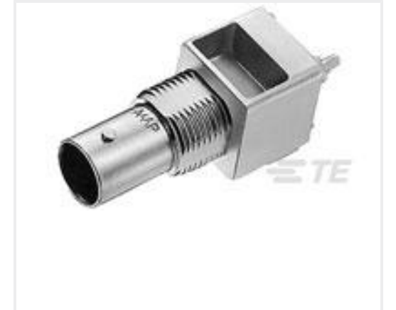
TE Part #227673-1 BNC PCB VERTICAL JACK W/POST