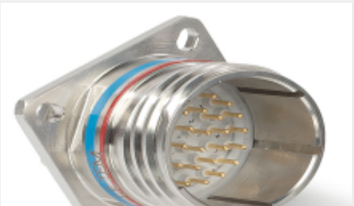
TE Part #YDTS20W11-35PCV001 RECP ASSY