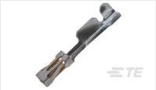
TE Part #6-87523-9 MOD IV RECP LP LF