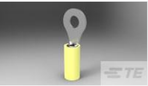
TE Part #2-326875-1 TERMINAL,PIDG R 26-22 6