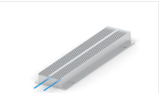
TE Part #2-1623821-8 CFH 1100 120R 5% 300MM LEADS