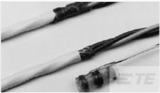
TE Part #201595-000 SO96-2-00