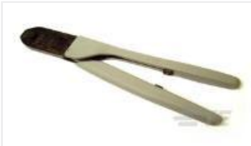
TE Part #91505-1 CCII TYPE III+ 24-16 ASSY