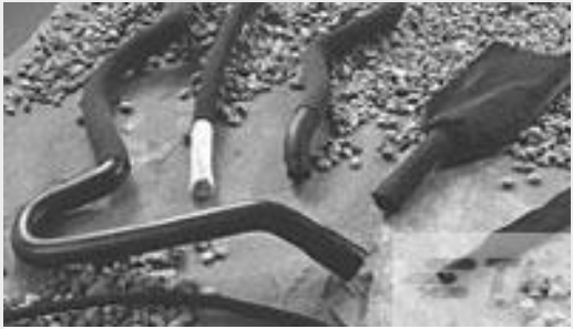
TE Part #9636344003 HFT5000-80/40-0-SP