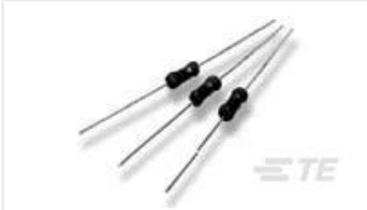
TE Part #3-1879350-3 RR01 5% 4R7 AMMO