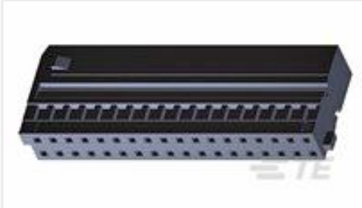
TE Part #1355930-2 BU-GEH 36P,HELLBLAU