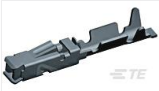
TE Part #2-1411550-1 ELOSTD M5300U91