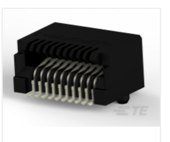
TE Part # CAT-SF59-C76264 SFP Connectors