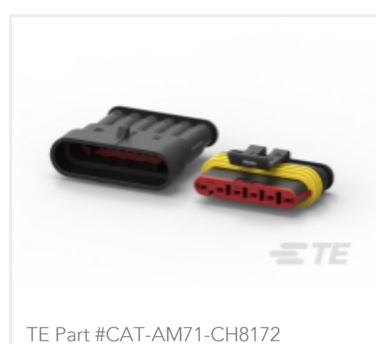
AMP SUPERSEAL 1.5MM, CONNECTOR HOUSING