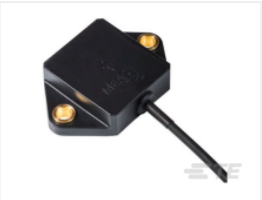
TE Part #G-NSDOG2-200 AXISENSE-2 CAN J1939-90 TILT SENSOR F MT