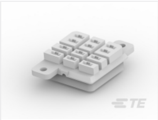
TE Part #1393143-1 27E043=SOCKET, KU, 11, SLG, NYL, N