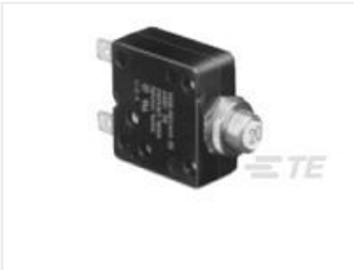
TE Part #4-1393249-0 W58-XC4C12A-10=W58