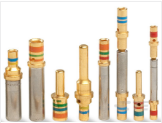
TE Part #0662-207-1282 CONT SOC ASSY