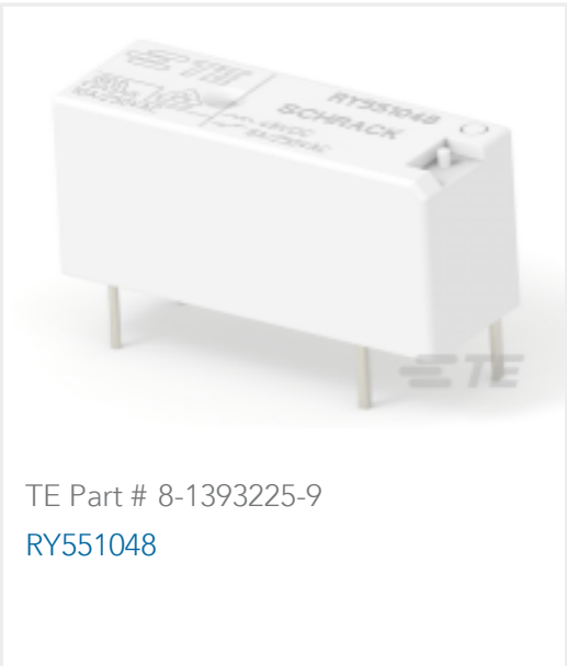
TE Part # 8-1393225-9 RY551048