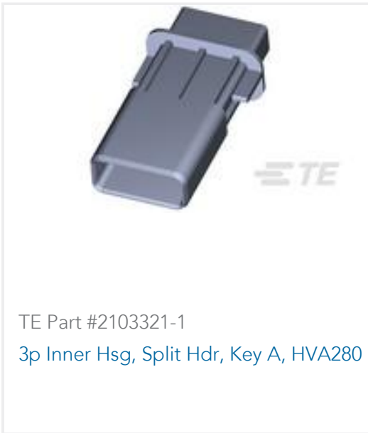
TE Part #2103321-1 3p Inner Hsg, Split Hdr, Key A, HVA280