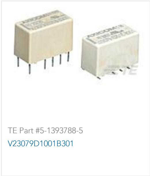
TE Part #5-1393788-5 V23079D1001B301