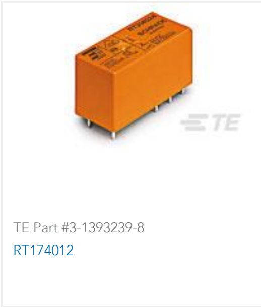
TE Part #3-1393239-8 RT174012