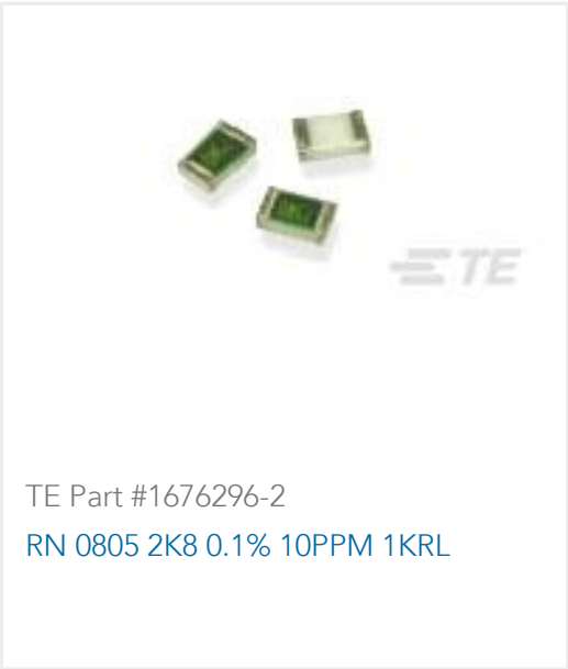
TE Part #1676296-2 RN 0805 2K8 0.1% 10PPM 1KRL