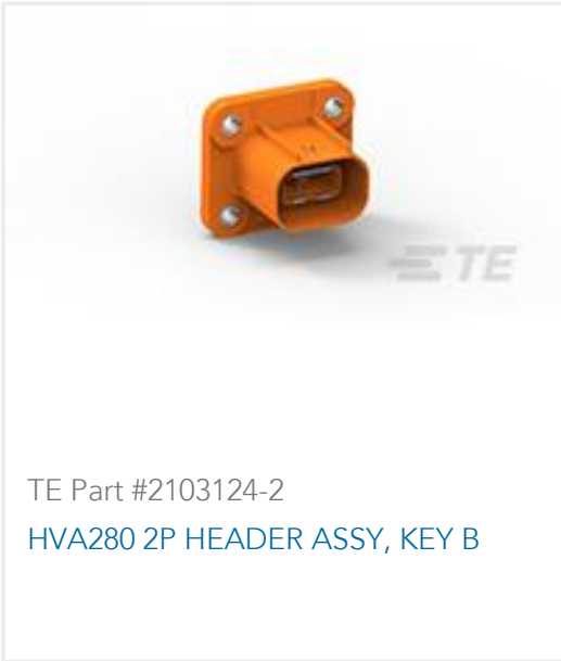
TE Part #2103124-2 HVA280 2P HEADER ASSY, KEY B