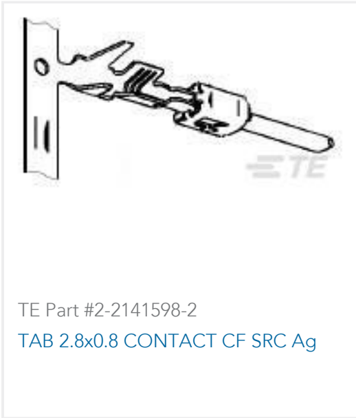
TE Part #2-2141598-2 TAB 2.8x0.8 CONTACT CF SRC Ag