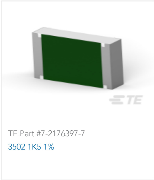
TE Part #7-2176397-7 3502 1K5 1%