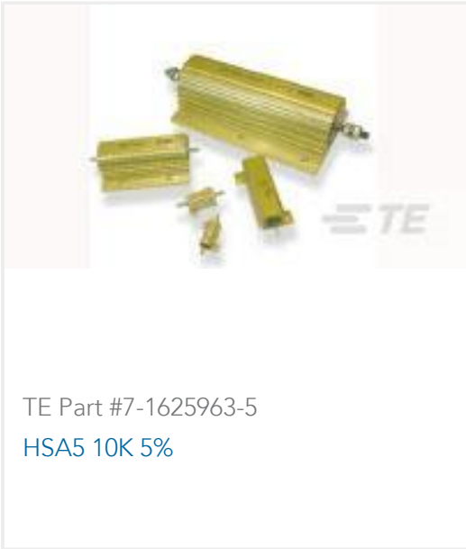
TE Part #7-1625963-5 HSA5 10K 5%