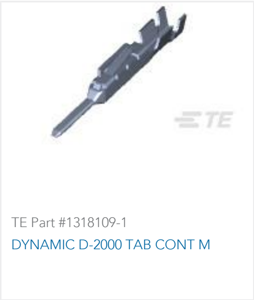
TE Part #1318109-1 DYNAMIC D-2000 TAB CONT M