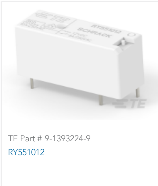
TE Part # 9-1393224-9 RY551012