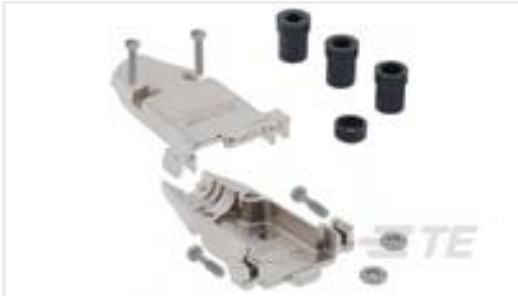
TE Part #5748676-1 DIE CAST CBL CLMP KIT,SZ 1