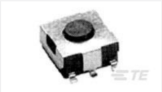
TE Part #1-1437565-8 FSM1LPATR=TACT SWITCH 6X6MIL S